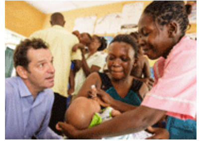
Super Hero Pack